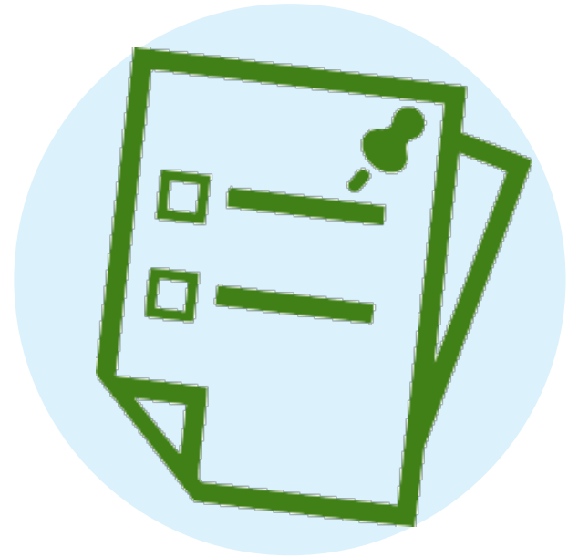
Treasury Board Secretariat of Canada Bulletin