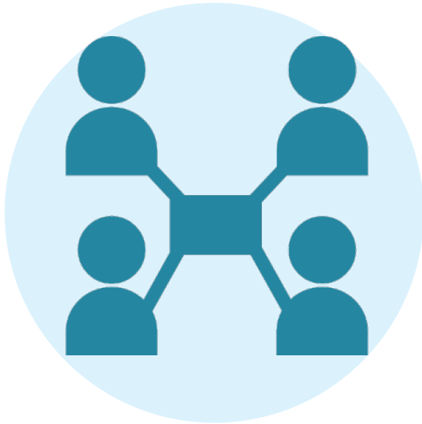
Aligning Efforts (federal labs and G&C proponents)