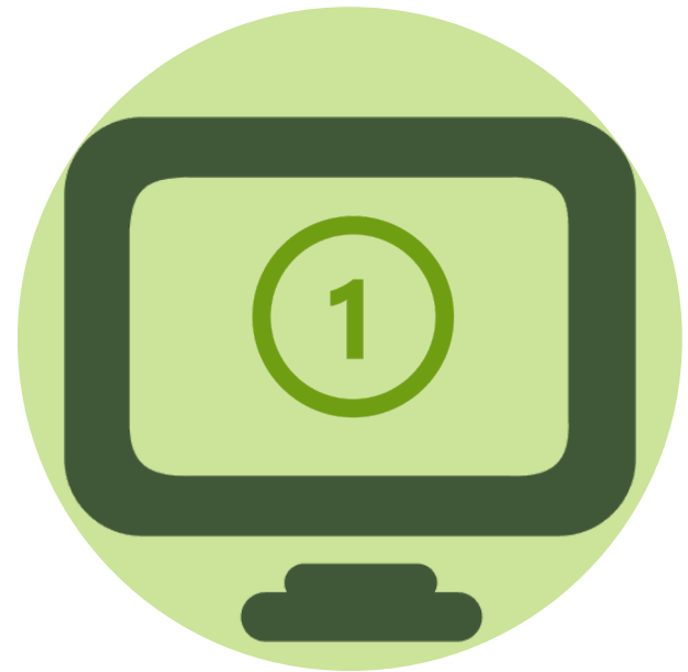
Shared Calls for Proposals