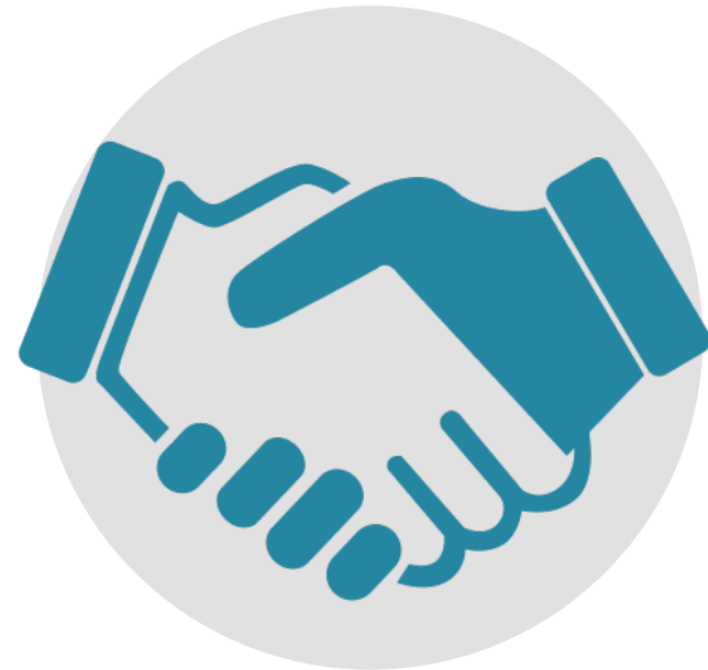
Clean Growth Program: Trusted Partnerships