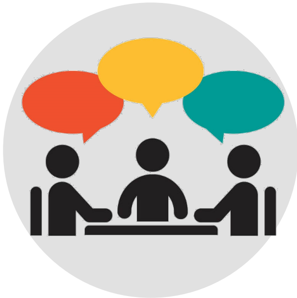
Impact Canada: 'Co-creation'